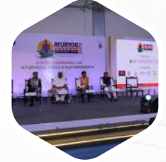
International Yoga & Naturopathy Conference