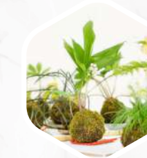
International Medicinal Plant Conference