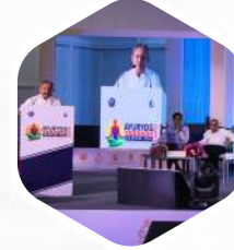
International Ayurveda Conference