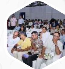
International Conference on Panchagavya & Ayurveda Veterinary