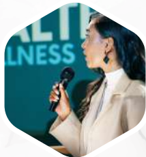
International Wellness Tourism Conference