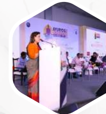
Ayush & Wellness MSME Meet